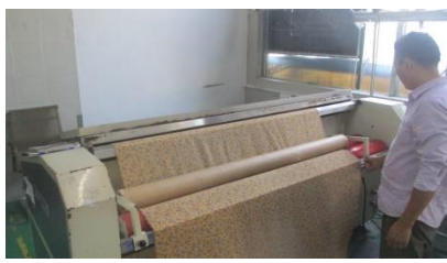
Flat Sewing Machine